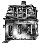
THE GEORGE CHAMBERLAIN HOUSE